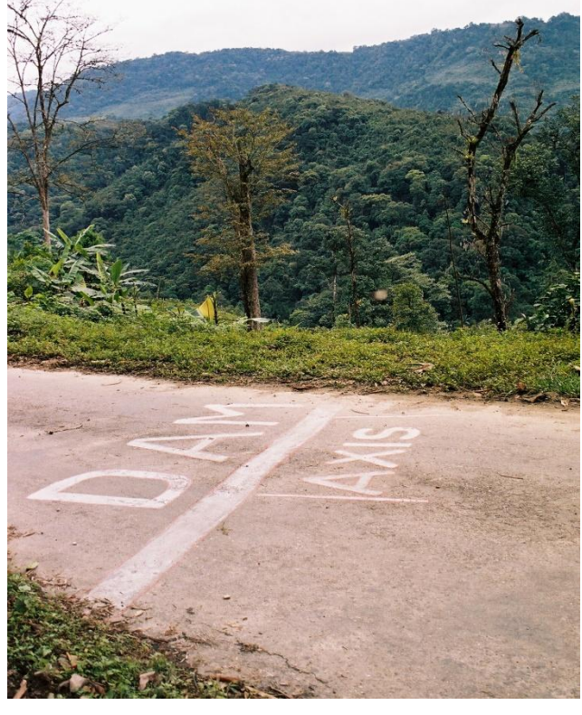
Rich biodiversity at a dam site.

The Northeast dams also struggled to obtain the nod of environmental experts. The national level Expert Appraisal Committee (EAC) for hydropower projects and the Forest Advisory Committee (FAC) are in charge of recommending environmental and forest approval to large projects. An approval from the standing committee of the National Board for Wildlife (NBWL) is needed in case of projects that affect Protected Areas. The Dibang project was rejected twice by the FAC. It took the intervention of the Cabinet Committee on Investments (CCI)