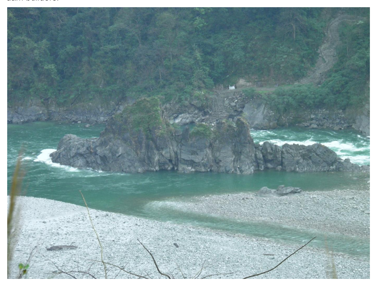
A sacred site downstream of Lower Demwe project.

The opposition to the projects within and outside courts has restricted the future operations of the dams to balance development with environmental concerns. For example, the NHPC was pushed to keep one turbine of Lower Subansiri running through the day to maintain water in the river and the NGT recommended a monitoring committee to oversee the implementation of Dibang project's environmental measures. The legal sanction to these projects poses an unprecedented challenge to regulatory institutions to monitor their operations in one of the most ecologically and seismically sensitive regions of the world. The period of construction and then the lifelong regulation of downstream flows once the projects are operational would require intense monitoring of multiple dam proponents on a daily basis. With the Arunachal Pradesh government having a considerable stake in the profits from running these dams, the regulatory system will have to reign in the state government and dam builders.